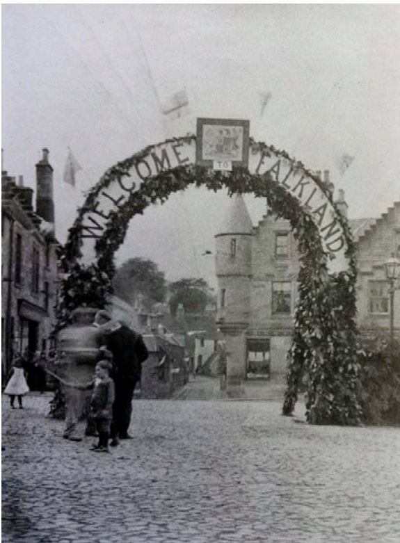
'Welcome Home' arch