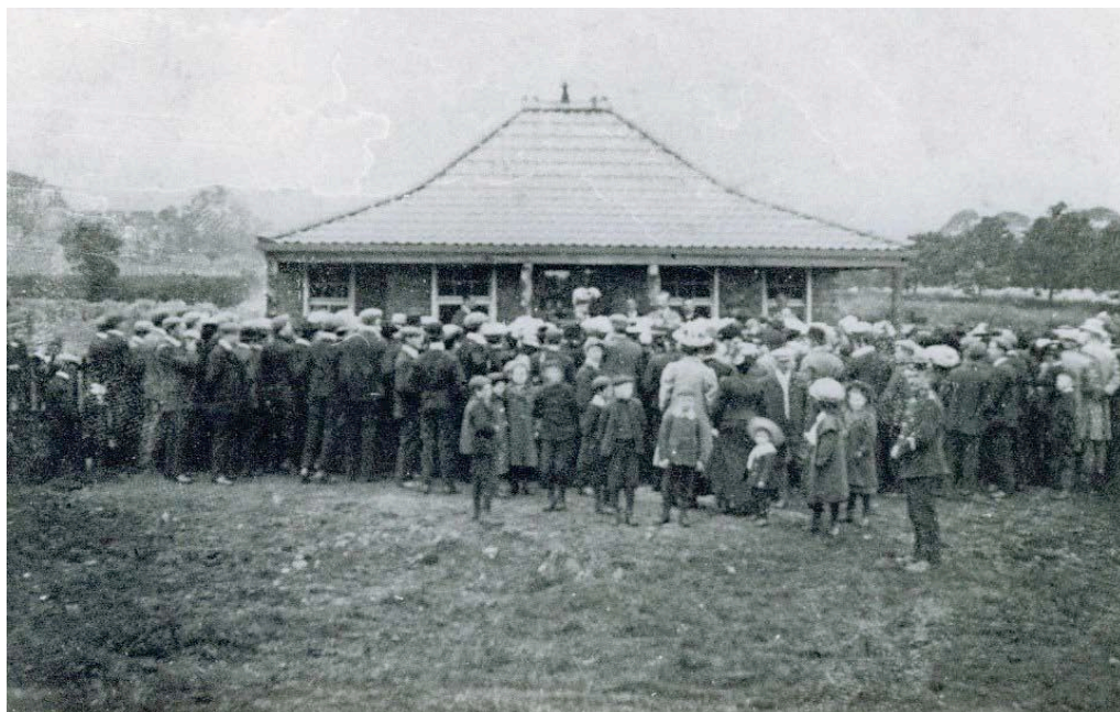
Falkland Golf Club Clubhouse Opening