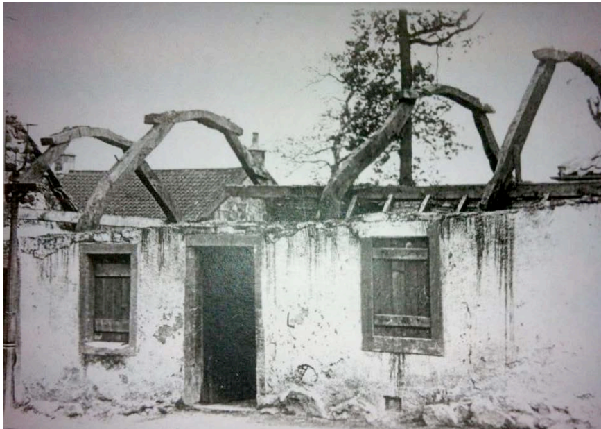
Oldest House in the Burgh of Falkland (High Street)

oak pins, the whole erection resembling the framework of the hull of a ship. The age of this old house cannot have been less than a couple of centuries, and may probably have been a great deal more. The oak when taken out was as fresh as the day when the hewers felled it in the adjoining forests of Falkland, and these interesting relics have wisely been preserved in one of the rooms of the old Palace. Until a few years ago, these "roof-trees" had sheltered Falkland Post Office as far back as the oldest inhabitant could remember. The house immediately adjoins the existing remains of the gate pillars of the "East Port" of Falkland, and it is not an unreasonable conjecture that it was at one time the abode of the keeper of that gate. The late Marquess of Bute, to whom the house belonged, evinced the keenest interest in the old building. Recently, however, it gave unmistakable signs of decay, and its demolition became a regrettable necessity in the interests of public safety."